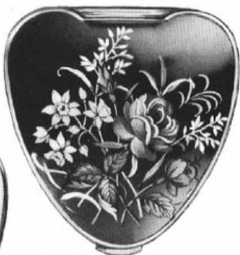
58-356 blue 204/- doz. Heart shaped gilt compact with translucent blue enamel background displaying a design of colourful flowers.