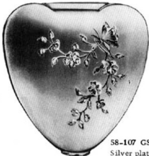
58-107 GSP 234/- doz. Silver plated compact with fine satin background highlighted by a design of butterfly and flowers in bright gilt.

This beautifully designed heart shaped compact is one of the most popular gift lines. Its unusual shape and extreme slimness delights the heart of young and old. Size 3" x 3". Supplied individually boxed, complete with puff, sifter and pochette, packed six to an outer.