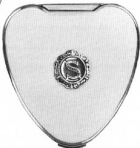
58-24 X white 252/- doz. The central glittering initial jewel mount is set on the flawless white enamel of this gilt compact. Initial instantly exchangeable and one additional free initial is supplied in the form of a voucher.