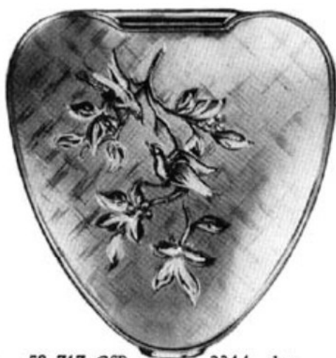
58-717 GSP 234/- doz. The background of this silver plated compact brings to mind the delicate shimmer of silk. An artistic design of birds and leaves in gleaming gilt finish.