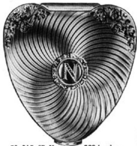
58-815 SP X 288/- doz. The lustrous engine turned design of this silver plated compact draws the eye to the central glittering jewel mount with initial. Initial instantly exchangeable and one additional initial supplied free in the form of a voucher.