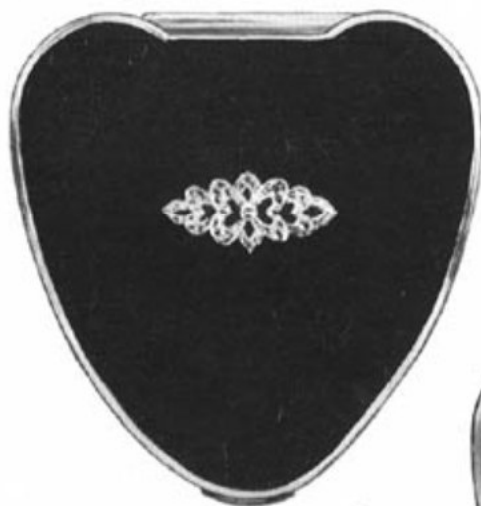
58-21 MJ 240/- doz. Lustrous black enamel highlighted by a slim gilt border forms the background for the delicate jewel mount.