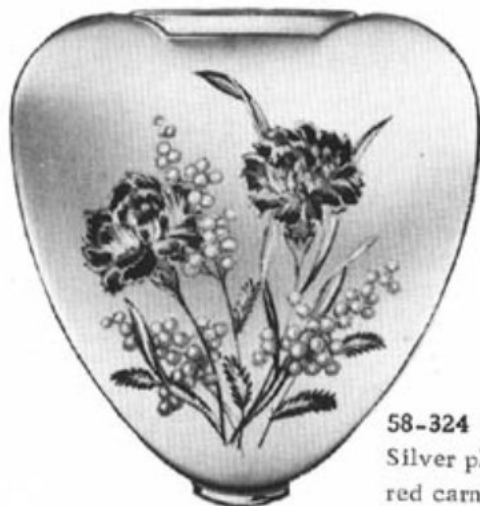
58-324 SP 222/- doz. Silver plated satin compact with a spray of red carnations and mimosa.

This beautifully designed heart shaped compact is one of the most popular gift lines. Its unusual shape and extreme slimness delights the heart of young and old. Size 3" x 3". Supplied individually boxed, complete with puff, sifter and pochette, packed six to an outer.