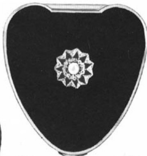
58-21 CP/24 300/- doz. A cultured pearl set in a dainty jewel mount on jet black enamel embellishes this exquisite gilt compact in jeweller's finish.