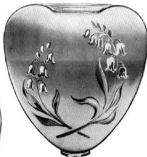
58-130 GSP 234/- doz. A silver plated compact of great elegance with satin background which sets off the pattern of bright gilt bluebells and leaves.