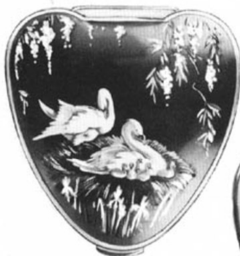
58-357 blue 204/- doz. Deep translucent blue background provides the perfect setting for the colourful design of swans and cygnets on this gilt compact.