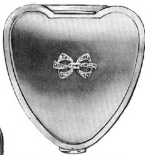
58-10 SP/MJ 267/- doz. Smooth silvery satin surrounded by a gleaming bright silver border provides the perfect setting for the delicate rhodium plated jewel mount of this silver plated compact.