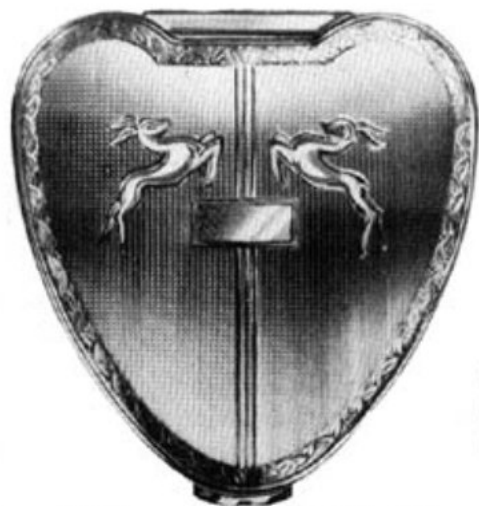
58-17 173/- doz. A graceful design of leaping deer on a fine engine turned background enhances this gilt compact. 58-17 GSP 234/- doz. As above in two tone gilt and silver plate.